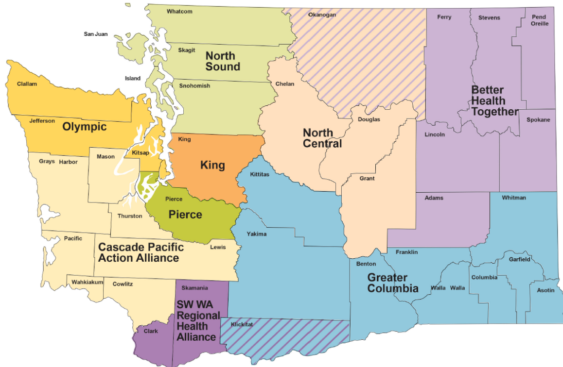
ACH Regions Map

Further information on ACHs is available at: