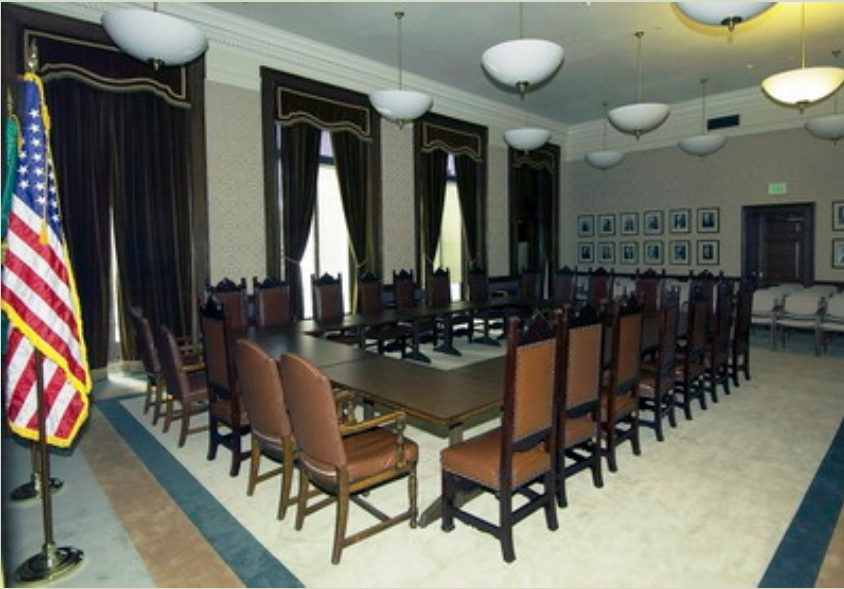
Senate Rules Room